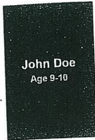
John Doe Age 9-10